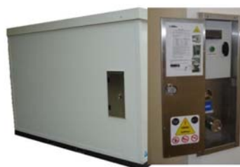
Side fill (optional)

Tel: +32 9 349 37 51 Fax: +32 9 349 37 52 Mail: info@blue1.be Website: www.blue1.be